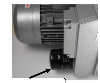
External oil filter

Clean the pump's sealing face for the filter and screw on a new filter firmly hand tight.